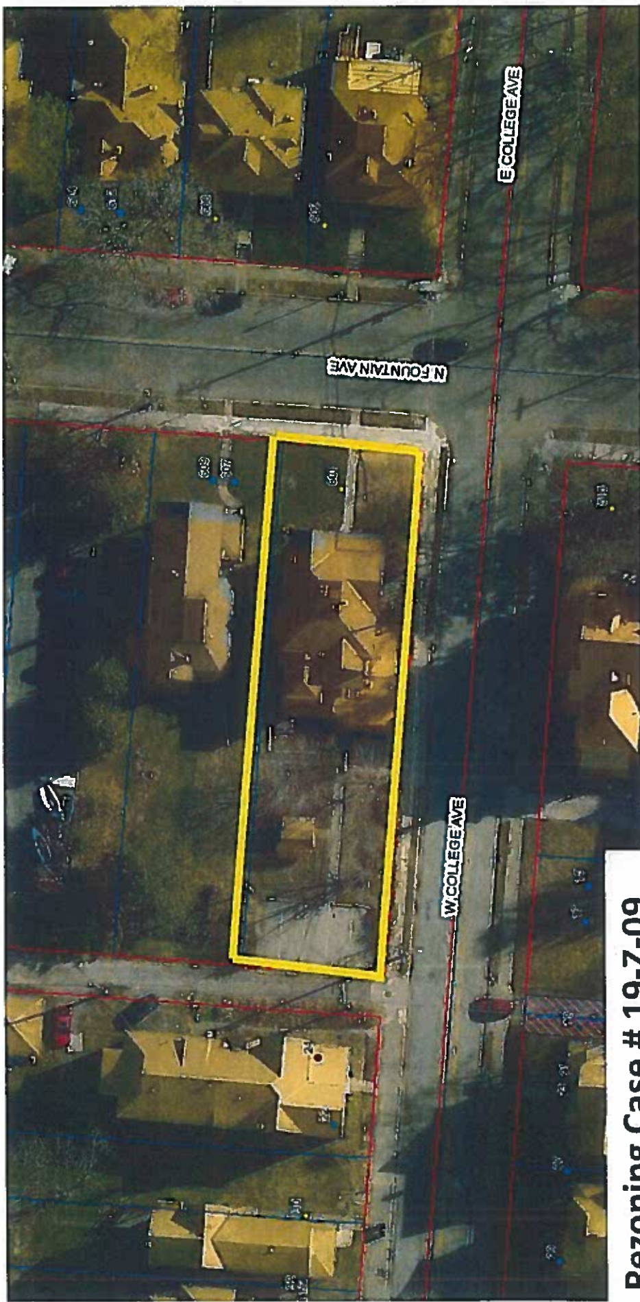
Rezoning Case # 19-Z-09 601 N Fountain Ave.