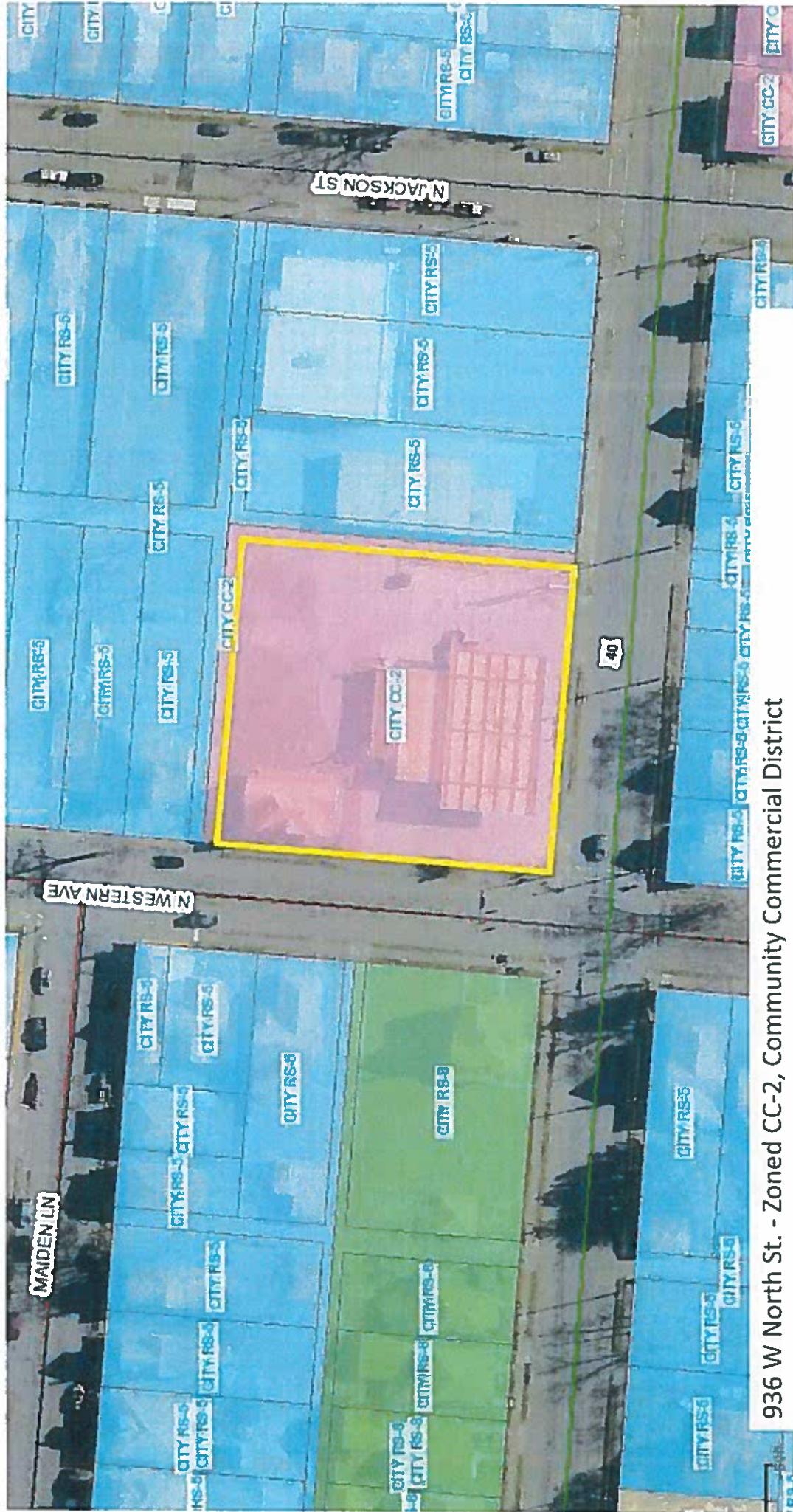
936 W North St. - Zoned CC-2, Community Commercial District