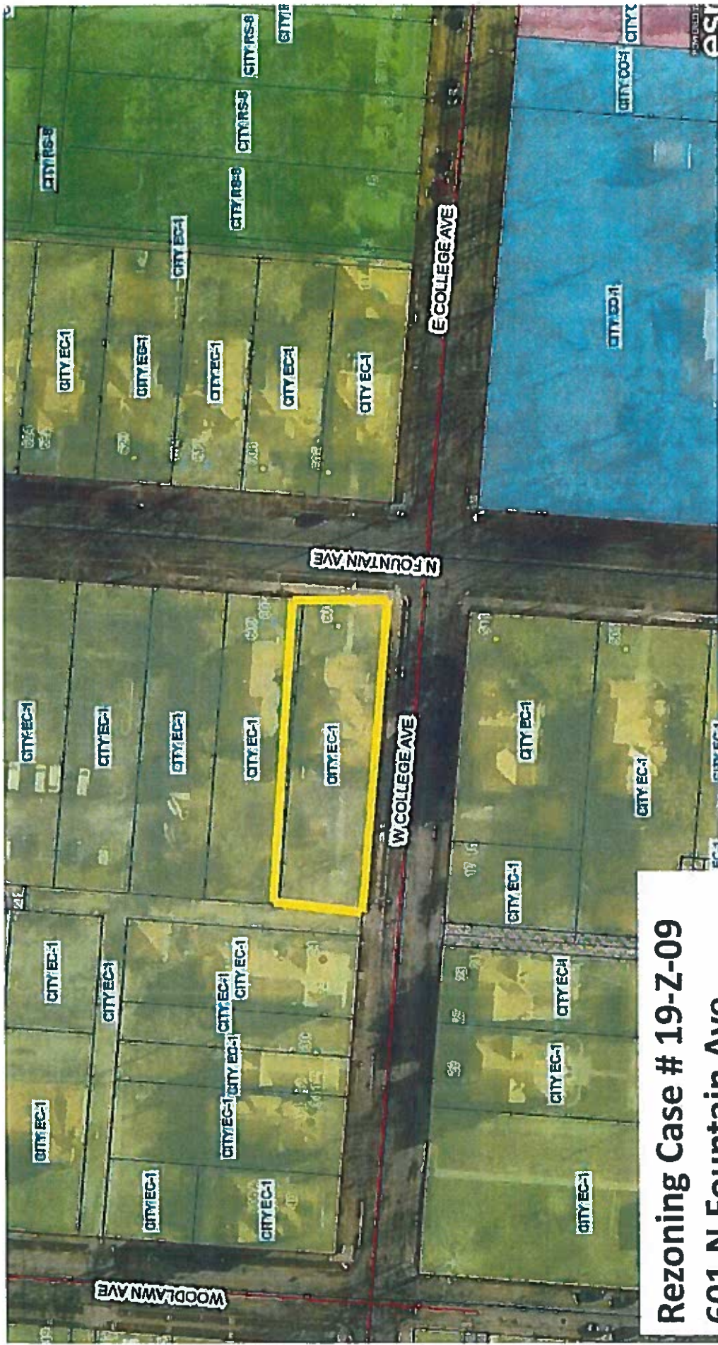
Rezoning Case # 19-Z-09 601 N Fountain Ave.